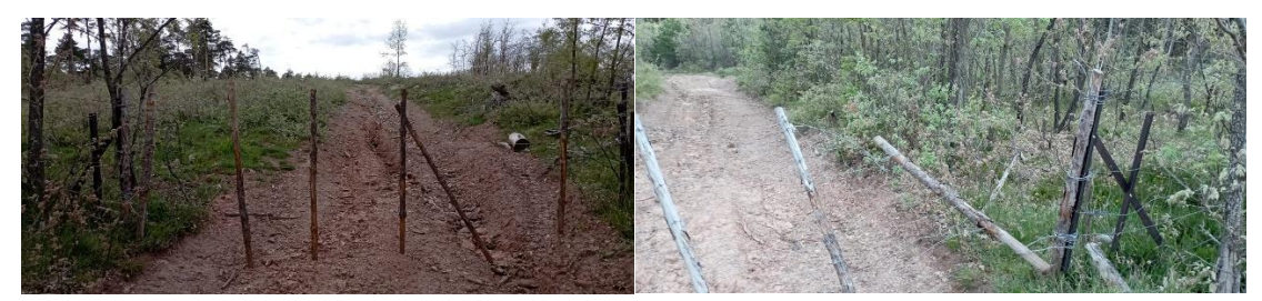
Passing through the closed fence

There are fences on the course that must be crossed. Along the fences, there are passages that must always be left as they were found, usually, closed. In the images, you can see two passages in the fence, the first open and the second closed.